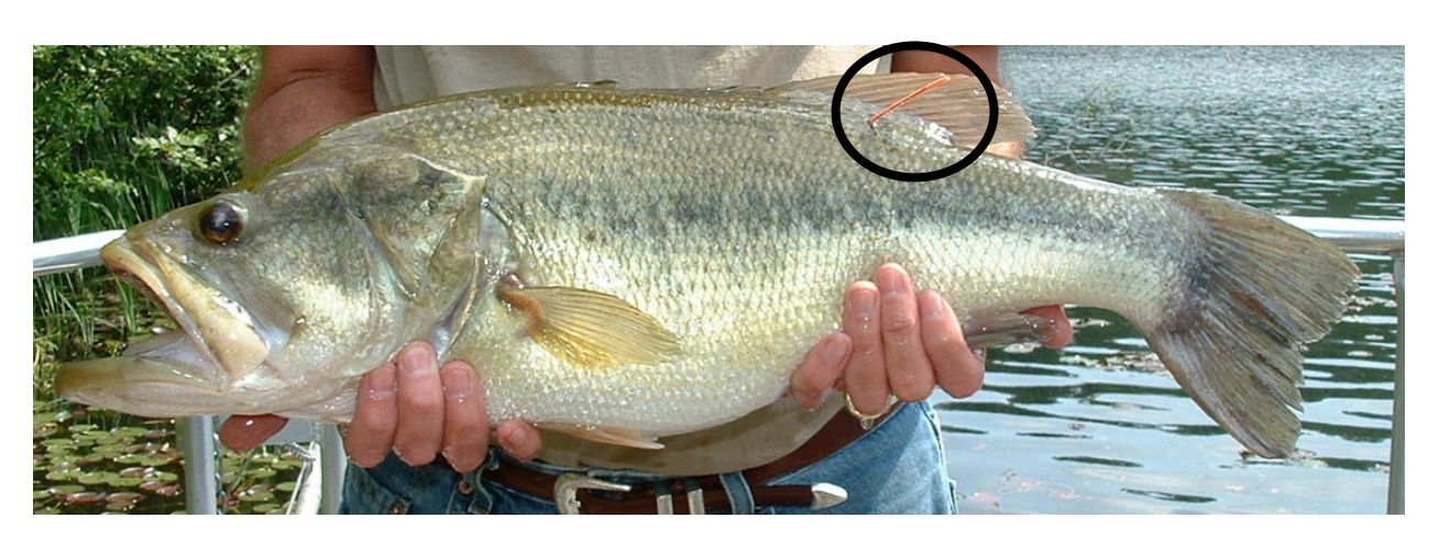
Largemouth bass inserted with a T-bar anchor tag.