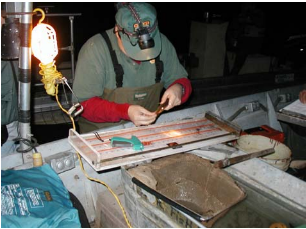
DNR Staff conducting tagging activities.